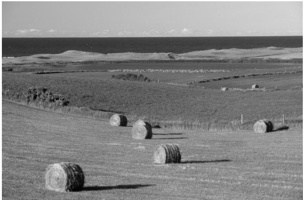
A portion of the land that the Land Trust has agreed to acquire the development rights for, Park Corner, PEI.

When the Land Trust is able to purchase development rights from farmers, everyone wins: farmers are able to extract valuable equity from their land, but continue to own and steward the land while, at the same time, the scenic coastal areas of PEI are preserved.